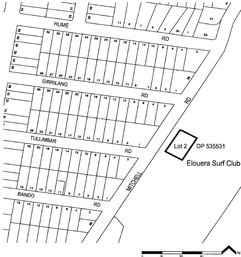
Map 27: Nos.66-94r Mitchell Road