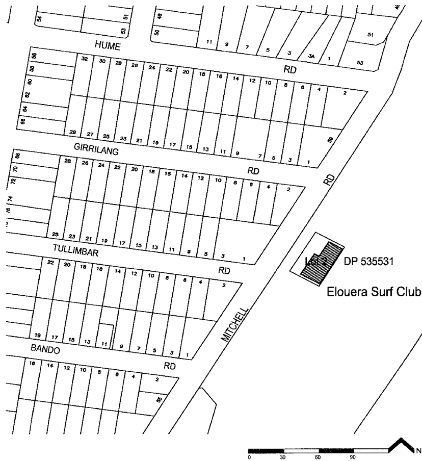
Map 08 Sheet 11: Nos.66-94r Mitchell Road