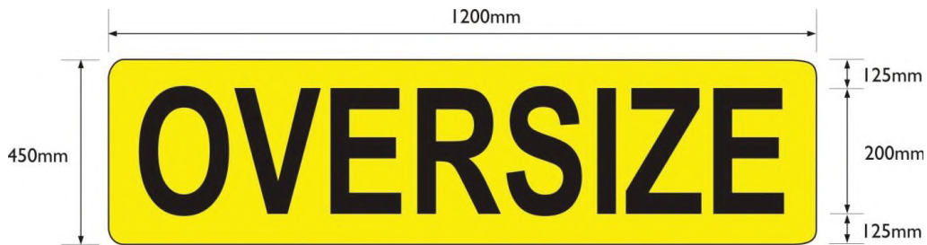
Diagram 4: Example of 'OVERSIZE' vehicle sign

Surface area of plate must be at least 0.540m 2