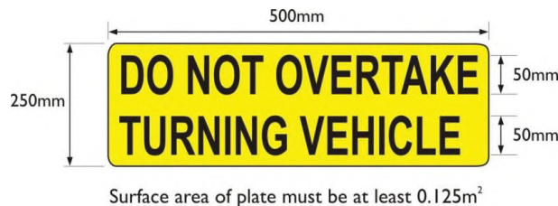
Diagram 3: Example of 'DO NOT OVERTAKE TURNING VEHICLE' Sign