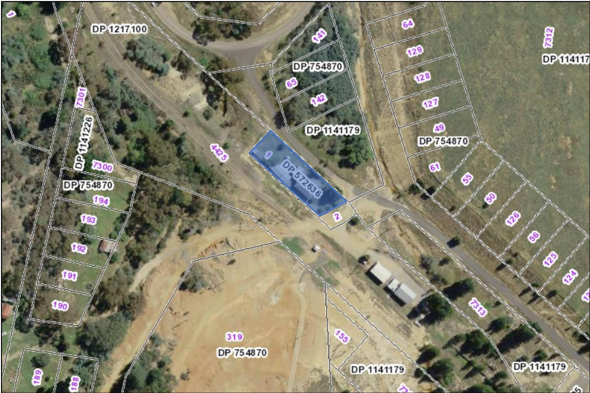
Image: Area of proposed declaration is coloured and highlighted blue.