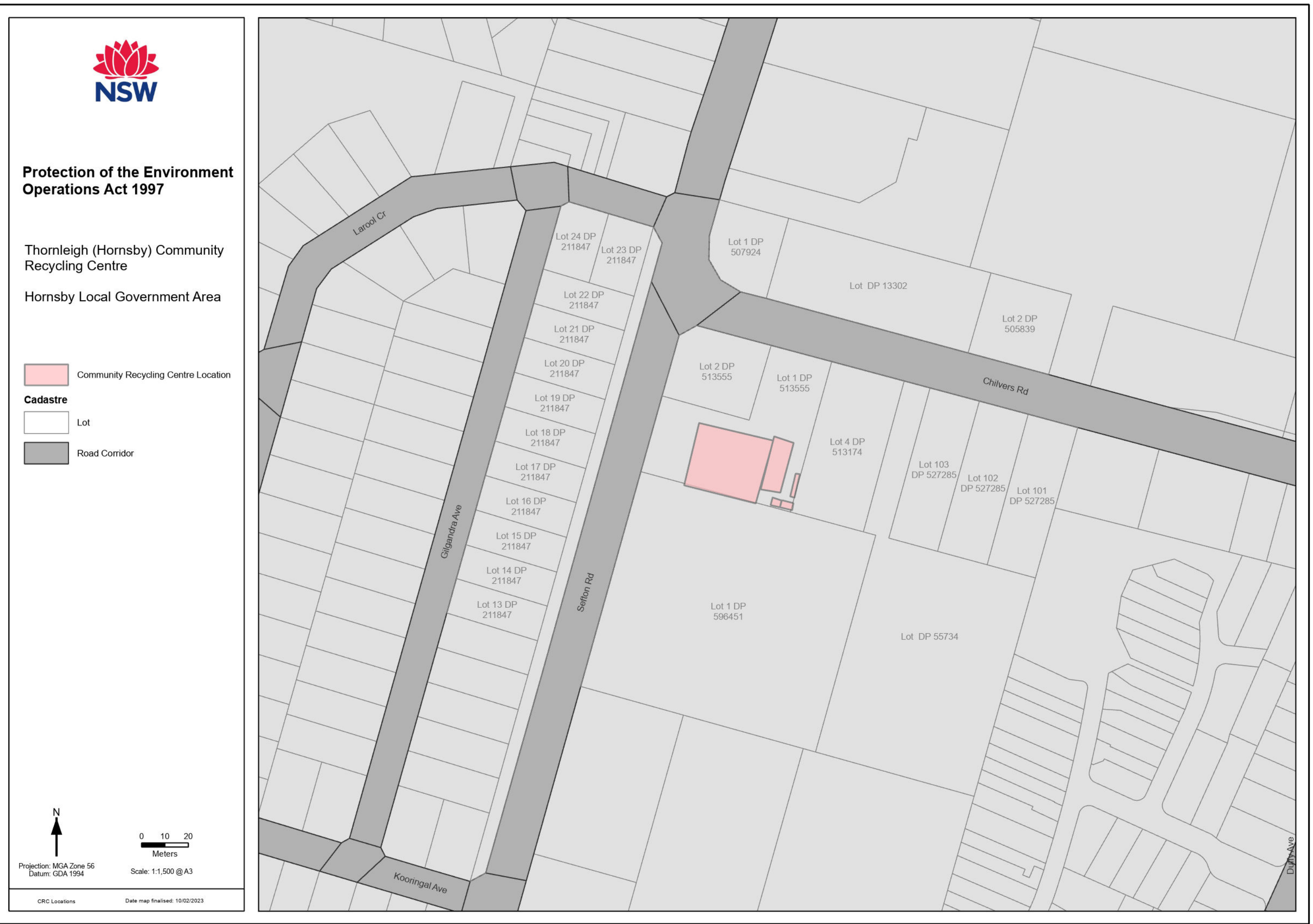
10 February 2023