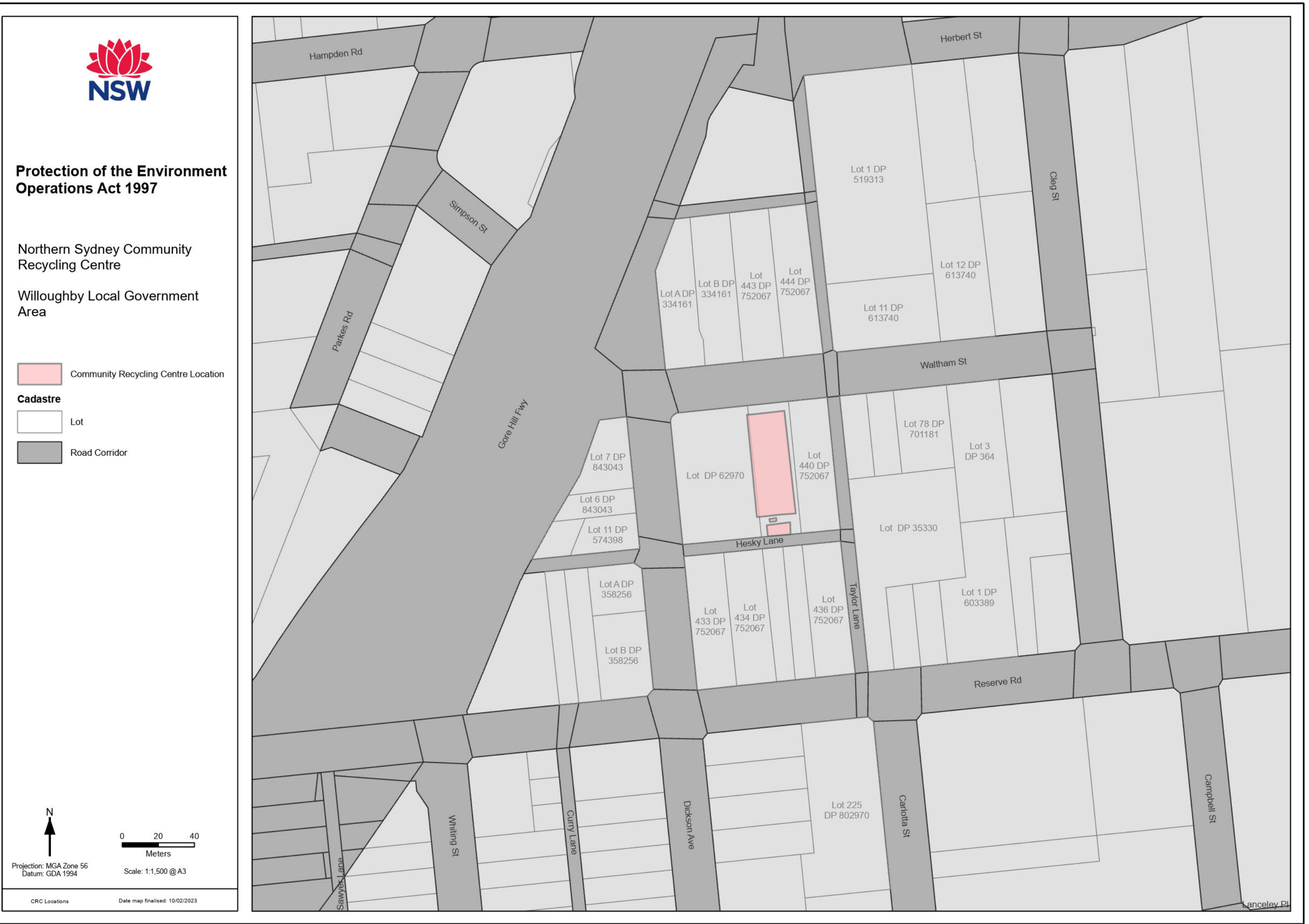
10 February 2023