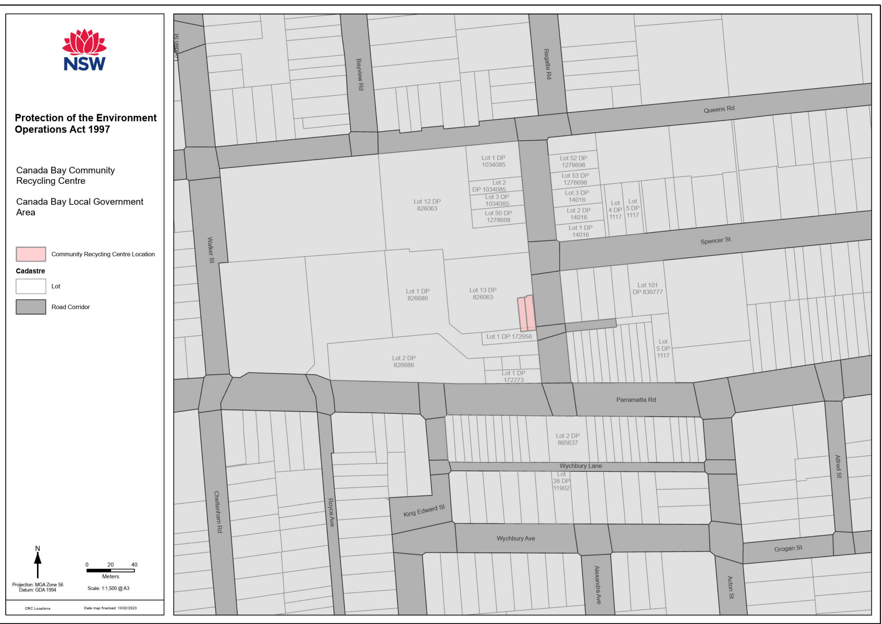
10 February 2023