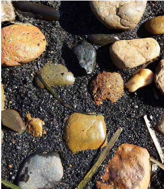
Annexure B – Metallurgical slag on soil surface (top), as in-fill below topsoil (bottom left) and zoomed metallurgical slag on soil surface impacted soil (bottom right)

While metallurgical slag has been observed at ground level, it is more common as in-fill material located 150-200 mm below ground level with a layer thickness up to about 200 mm. Metallurgical slag is discernible from flue dust by its black colour. Slag impacted soil will have a black colouration associated with it rather than an ordinary brown appearance of flue dust impacted soil.